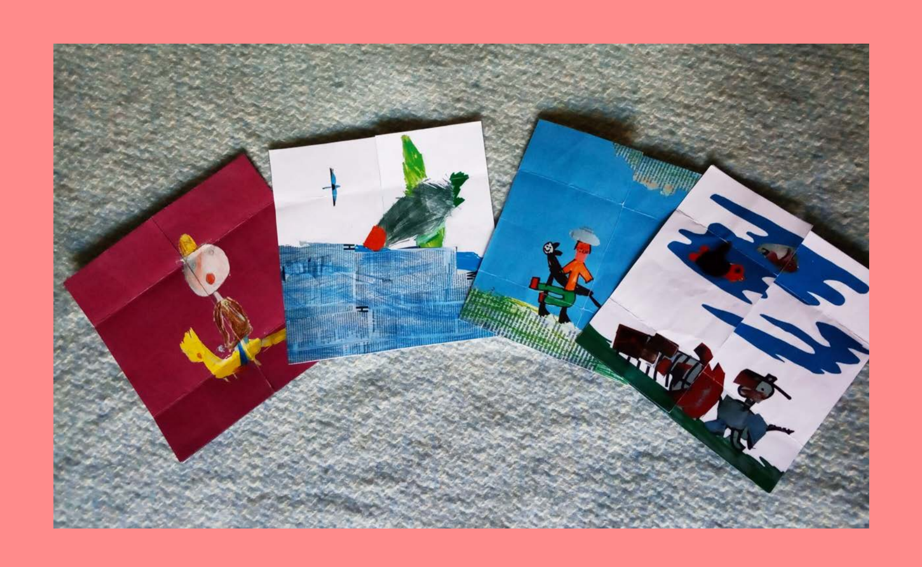
Books of stories made buy the children